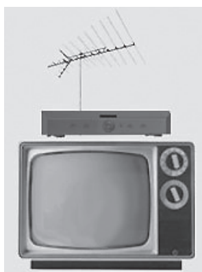
A converter with your old TV and antenna