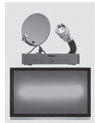
New or old TV with a digital subscription to a cable, satellite, or telephone provider